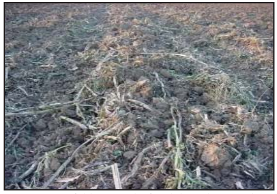
Figure 15. A field one week after disking down a robust legume cover crop and vetch. After the residue decomposes further, the producer will disk one more time prior to forming the planting beds.

Tillage or Disking: Tillage or disking is generally used to incorporate crop residue into the soil. If the amount of residue is small, it might be left on the surface. Lilliston cultivators can be used for light amounts of residue, but for higher biomass covers, or for crops with dense root masses, such as sorghum-sudan, disking or spading the residue into the soil is needed before the next crop is planted. If cover crop residues can be left on the surface, the risk of erosion can be reduced.