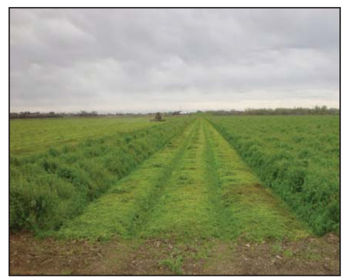
Figure 13: Flail-mowed vetch beds.

Mowing: Mowing is often used to terminate a flowering cover crop before incorporation with a disc. It is a quick method to ensure that cover crops do not go to seed. There are three basic types of mowing machines: sickle bar, rotary and flail. Sickle bars are fast and leave large pieces of stalks on the surface of the ground. They are optimal for a slow decomposing mulch to cover the soil. Rotary mowers (like those commonly used for lawns) are useful in orchard settings to cut groundcover close to trees, but they do not chop residue, leaf litter and prunings as finely as flail mowers. Flail mowers generally require more horsepower than rotary mowers and provide a finer chop may allow for slightly quicker decomposition of the residue. Some producers might opt to transplant directly into a mowed cover crop, a minimum-till option that is usually easier to adopt than roller crimpers. Be aware of challenges inherent with this approach such as cooler, wetter soils and potential pest problems (i.e rodents or slugs).