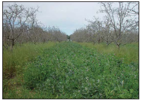
Figure 19: Walnut orchard floor prior to grazing. Note the tall grasses and mix of cover crop species compared to the grazed orchard floor on the right.

Grazing: Depending on the cover crop's purpose, grazing can be an effective method for cover crop management. Grazing removes a substantial portion of the vegetation and may interfere with the goal of enhancing soil organic matter. Grazing animals deposit manure and urine on the soil which has nutrient management as well as potential food safety implications. Producers should consult with their organic certifier as well as NRCS prior to grazing any cover crops.