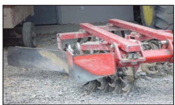
Figure 7: This Lilliston cultivator can be used for light tillage for weed control in the top few inches of soil as well as for incorporation of cover crop residues.

broadcasted over a drilled grass seed. In warm, dry conditions, plant a little deeper (up to 50% deeper); in cool wet conditions plant a little shallower (Schonbeck, 2011).