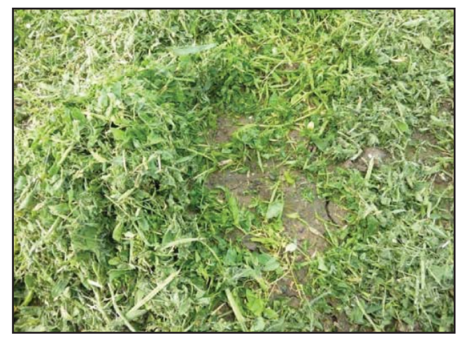
Figure 14: Residue of vetch cover crop is about 3-4" thick. In this situation the residue was be allowed to dry down, and then lightly incorporated with a Lilliston cultivator.

Tillage or Disking: Tillage or disking is generally used to incorporate crop residue into the soil. If the amount of residue is small, it might be left on the surface. Lilliston cultivators can be used for light amounts of residue, but for higher biomass covers, or for crops with dense root masses, such as sorghum-sudan, disking or spading the residue into the soil is needed before the next crop is planted. If cover crop residues can be left on the surface, the risk of erosion can be reduced.