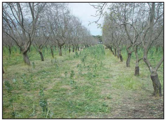
Figure 20: This organic walnut orchard has been grazed by sheep which left the bell beans standing, but devoured the Austrian peas, vetch, and in-row grasses.