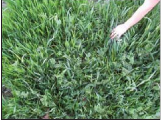
Figure 3. Fall seeded annual rye, vetch, winter peas, favas, and crimson clover serve multiple purposes in Western OR. (Sarah Brown)