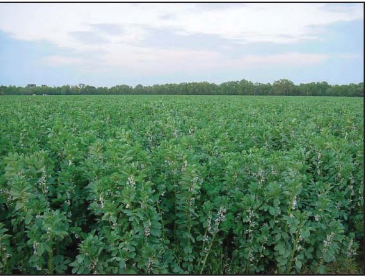
Figure 2. Six-foot-tall fava bean cover crop, Fong Farms, Woodland, California 2006.

Funded by a grant from Western Sustainable Agriculture Research and Education (WSARE).