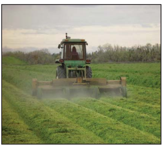
Figure 12: Vetch cover crop being flail mowed close to the bed surface.

Mowing: Mowing is often used to terminate a flowering cover crop before incorporation with a disc. It is a quick method to ensure that cover crops do not go to seed. There are three basic types of mowing machines: sickle bar, rotary and flail. Sickle bars are fast and leave large pieces of stalks on the surface of the ground. They are optimal for a slow decomposing mulch to cover the soil. Rotary mowers (like those commonly used for lawns) are useful in orchard settings to cut groundcover close to trees, but they do not chop residue, leaf litter and prunings as finely as flail mowers. Flail mowers generally require more horsepower than rotary mowers and provide a finer chop may allow for slightly quicker decomposition of the residue. Some producers might opt to transplant directly into a mowed cover crop, a minimum-till option that is usually easier to adopt than roller crimpers. Be aware of challenges inherent with this approach such as cooler, wetter soils and potential pest problems (i.e rodents or slugs).