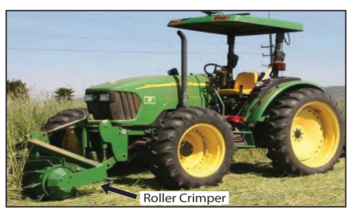
Figure 17: This rye cover crop was terminated using a roller crimper.

Cover crop varieties and timing of termination are crucial components to ensure success in an organic system. Cover crops must reach early flowering to be effectively terminated with roller crimpers. For more information see 'Organic No-Till Farming' listed in resources, Appendix B.