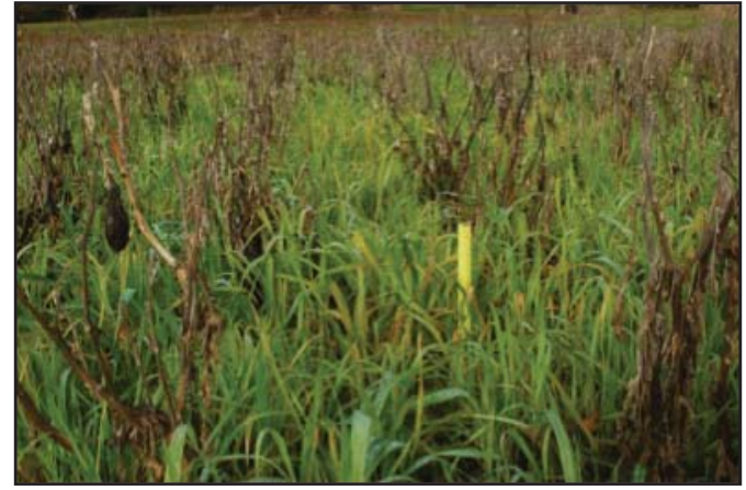
Figure 10. Eggplant oversewn with oats in Western Oregon.

In a western context, establishment of a relay-seeded cover crop will depend on the type of irrigation used. Sprinkler or furrow irrigation will support this approach, but over-seeding into a field using buried drip will likely not be successful. Ideally, overseeding should occur just prior to a rain event or scheduled irrigation. Over-seeding will likely require higher seeding rates to overcome light, moisture, and