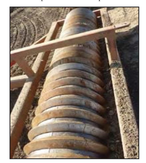
Figure 8: A cultipacker, or ring-roller, is used to firm the soil surface which helps seed-tosoil contact and breaks clods of soil. They can be used successfully to lightly incorporate cover crop seed.

Cover crops can be planted in the fall, spring, or even the summer. The timing depends on the purpose for implementing the practice as well as equipment and the cover crop species chosen. In some areas, during most years a cover crop planted in the fall can germinate and grow simply on rainfall. However, it may require sprinkler irrigation in order to bring up a fall-planted cover crop if the rains are late or it is a dry year. A summer cover crop will be more expensive because in most locations it will require irrigation and involves a higher opportunity cost as a cash crop is foregone during the main growing season. Drought tolerant summer cover crops like Sudan x Sorghum hybrids can grow well with little to no irrigation.