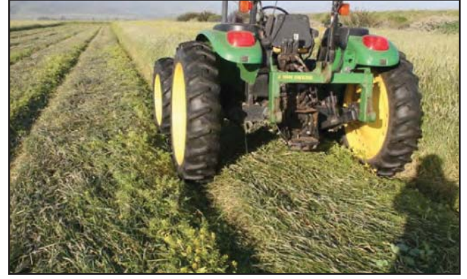
Figure 18: Terminating cover crops on beds using a roller crimper. (Eric Brennan)

Grazing: Depending on the cover crop's purpose, grazing can be an effective method for cover crop management. Grazing removes a substantial portion of the vegetation and may interfere with the goal of enhancing soil organic matter. Grazing animals deposit manure and urine on the soil which has nutrient management as well as potential food safety implications. Producers should consult with their organic certifier as well as NRCS prior to grazing any cover crops.