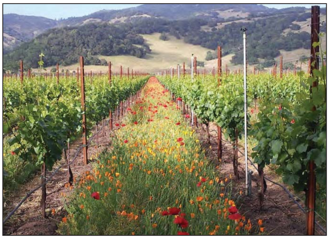
Figure 22. This cover crop in a vineyard provides good habitat for beneficial insects and is aesthetically pleasing.