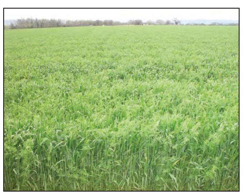
Figure 5. Stand of a vetch and oats, unbedded.

To establish a cover crop successfully, field preparation is the first critical component to address. Two of the primary issues to consider are weed management and the development of a smooth seed bed for good seed-to-soil contact. Ideally field preparation will mirror that for annual cash crops, but can be less intensive. Soil should be worked at an appropriate moisture level to be free of clods and ensure good seed-to-soil contact. In order to gain the maximum benefit from the cover crop, producers should provide appropriate moisture. In some cases producers can relay seed into young vegetable plantings at the end of the weed management period and establish cover crops with no seedbed preparation or seed incorporation. If cash crops are harvested very late, consider relay seeding options, or broadcast annual ryegrass and common vetch after harvest.