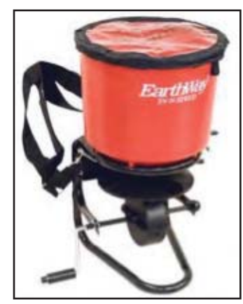
Figure 9: A broadcast seeder, or 'belly grinder', appropriate for small acreage seeding. (Earthway).

One major problem with many methods of incorporating broadcast seed is that often they place the seed too deep, requiring seeding rates 1.5 to 2 times higher than drilling. However, if not set properly, seed drills can easily place seeds too deep as well. Conversely, it is equally important not to place seeds too shallow and avoid them being eaten by birds or drying out after germination and before establishment. Use the recommended seed depth for each cover crop species and be especially careful when seeding mixes. Some drills have an additional hopper where smaller seeds like clover can be placed so that they are