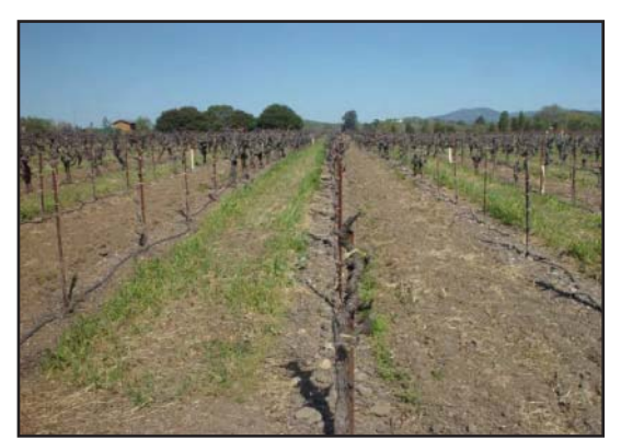
Figure 21. Disking cover crops in every other alley in a vineyard allows the grower access to all vines when the rainy season arrives and keeps down dust.

Cover crops are an important component of organic orchard floor management. They may be planted in the grass alley, legumes planted for nitrogen, or flowering species planted for beneficial insects. While living mulches in the tree row are often used, cover crops can also be grown in the alley and used on the tree row. Often called "mow and blow," this system blows clippings from mowing the alley on to the tree row with side discharge mowers. The alley planting can be grass that produces biomass for mulch,