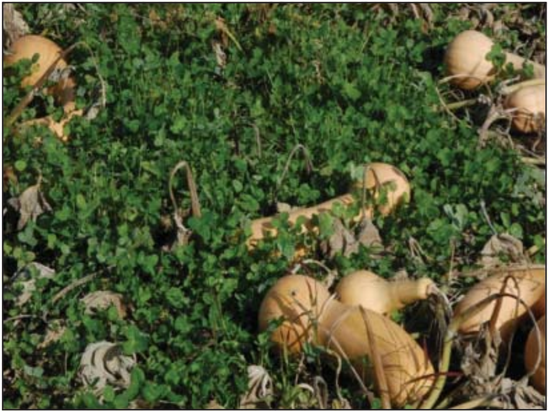
Figure 11. Butternut squash oversewn with red clover in late June/early July just before last cultivation and canopy closure. (Nick Andrews)

nutrient competition. Producers may consider using a more shade tolerant variety based upon the crop they are seeding. White clover, annual ryegrass, rye, hairy vetch, crimson clover, red clover and sweet clover tolerate some shading (Clark, 2007). Broadcasted seed should be heavy enough to fall through the crop canopy. More information about relay-seeded cover crop opportunities and rotations can be found in Table 4, Appendix A.